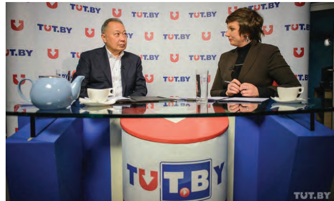
Toppled Kyrgyz president Kurmanbek Bakiev found a new home in Belarus.

The Belarusian position on Crimea and the conflict in Eastern Ukraine made Belarus-Russian relations even tenser. However, Minsk did not hesitate to continue with its policies, and has for instance kept cooperating with Turkey after Turkish-Russian relations soured in November 2015 in connection with the war in Syria. As Russia and Turkey broke off their political, economic and cultural relations and increased their confrontation through proxies in Syria, Minsk demonstratively kept working with Ankara, and president Lukashenka even went to Istanbul to attend a summit of the Organisation of Islamic Cooperation (OIC) in April 2016.