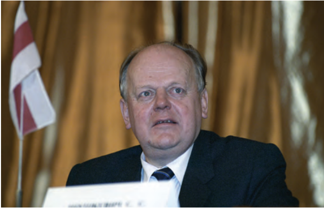
Stanislau Shushkevich, Chairman of the Supreme Soviet of Belarus in 1991-1994. He was against Belarus joining the Tashkent Treaty on Collective Security.

This neutrality, however, remained a purely declarative norm in Belarusian constitutional law throughout the 1990s until roughly the mid-2000s. Very few politicians tried to implement it. Examples of these attempts included resistance from Belarus to joining the Tashkent Treaty on collective security issues concluded between some former Soviet nations in May 1992. This resistance was led by the then Chairman of the Belarusian Supreme Soviet (parliament) Stanislau Shushkevich. He managed to delay signing the Tashkent Treaty by some months.