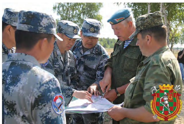
2015 Joint Belarusian-Chinese military drills in Brest province.