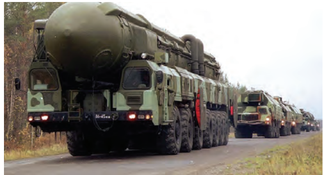
Russian nuclear weapons left Belarus in November 1996.

Meanwhile, in 1997 Belarus became an observer, and in 1998 a full member of the Non-Aligned Movement. Minsk was probably more interested in using this Movement to seek new foreign partners, but it nevertheless participated actively in the organisation's work.