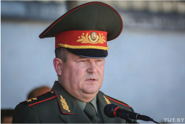
Belarusian defence minister Andrei Raukou called the issue of a possible Russian airbase in Belarus "political."

After lengthy negotiations Minsk managed first to change the geographical location of the base, moving it as far away as possible from NATO's borders. It then made Russia reduce the amount of aircraft it planned to deploy. Finally, Belarusian leadership in autumn 2015 refused to accept the Russian airbase under any pretext.