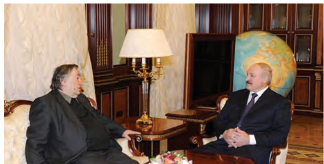
Promoting the “Israeli model” for Belarus-Russian relations: Lukashenka meeting Russian radical right-wing author Alexander Prokhanov.

In the late 1990s and early 2000s, Lukashenka and his government gradually shaped their vision of Belarusian-Russian relations and set out to become Russia's closest ally. In June 2009, Lukashenka voiced this sentiment in an interview with his long-time Russian sympathiser Alexander Prokhanov: “Americans are financing Israel by giving it as many loans as it can absorb and then writing them off. And they completely finance Israel's defence. Let's not literally but conceptually apply their model [to Belarus-Russian relations]. After all, we are more important to you than Israel is to America.” 11 However, this idea – to be a kind of “Russia's Israel” was not new by 2009, 12 and had already been discarded by the course of history.