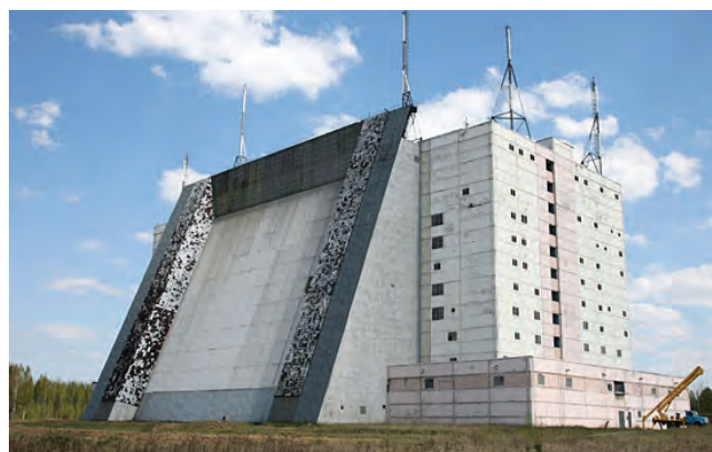
Russian military facility in Hantsavichy.