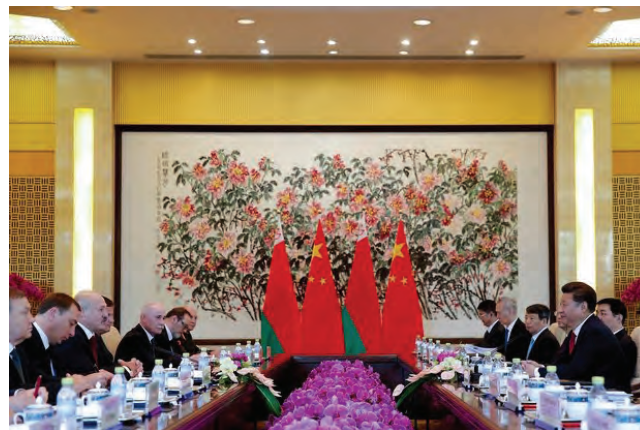
Development of relations with China became a strategic priority for the Belarusian government.

Minsk’s contacts with China have attracted more attention. Since the beginning of his presidency, Lukashenka considered relations with China a priority for Belarusian foreign policy. This prioritisation became even more pronounced after Belarus started to suffer from a huge deficit in trade with China beginning in 2005. Nonetheless, Minsk pressed on building up contacts with Beijing in all spheres: political, military, cultural, etc. 14 It is becoming increasingly evident that Belarusian leadership considers China a counterweight to Russia. This is also becoming evident to Russia. In 2006, Minsk tried without success to join the Chinese-dominated Shanghai Cooperation Organisation, which could become a kind of alternative to more intrusive post-Soviet organisations dominated by Moscow, e.g. CSTO, CIS, EurAsEC 15 . Russia did not hide its opposition to this move 16 and Belarus only became a partner on dialogue in the SCO in 2009, obtaining observer status in 2015.