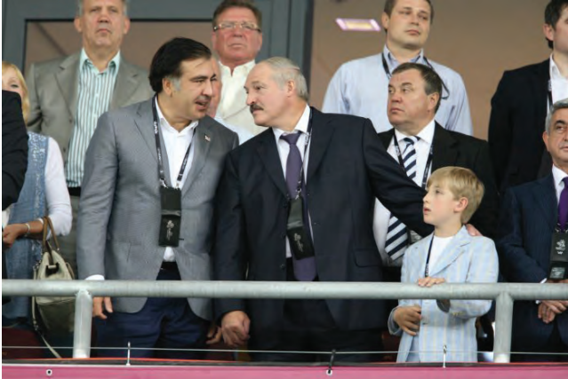
Belarusian and Georgian leaders have enjoyed friendly relations since the mid-2000s.

which entailed importing Azerbaijani oil in exchange for Venezuelan delivered to Belarus via Ukrainian territory.