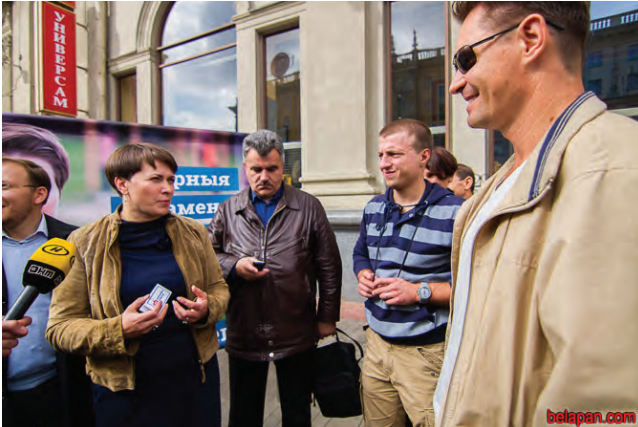
In September 2015 presidential candidate Tatyana Karatkevich demanded “military neutrality” for Belarus.

The roots of Belarusian neutrality are, therefore, not ideological. By pursuing neutrality, Minsk is mostly acting according to pragmatic needs of national survival. It was difficult external conditions that made the Belarusian government begin to implement a neglected constitutional tenet.