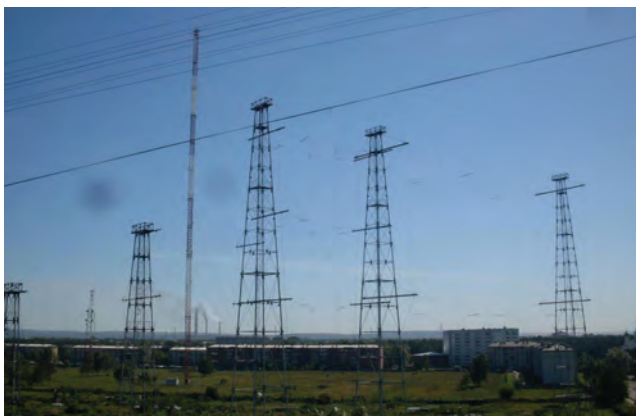
Russian military facility in Vileyka.

The situation worsened in the 2010s due to financial constraints, and Minsk was left with largely obsolete Soviet aircraft. By that time Minsk had no functioning heavy Sukhoi Su-27 fighter jets at all. Earlier, in the mid-2000s, the Belarusian government had halted the modernisation programme of MiG-29 light fighter jets for ten years due to a lack of funds. This programme was relaunched only in late 2013 after Minsk realised that Russia would not give it newer aircraft.