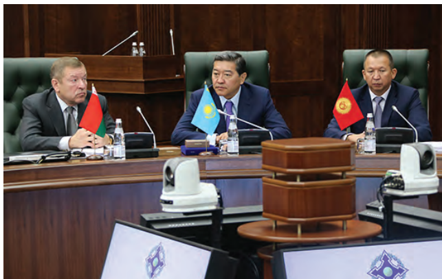
Belarusian defence minister Yury Zhadobin attends a CSTO Ministerial Council Meeting in Moscow in June 2014.

integrity. This irritated Armenia because it meant supporting Azerbaijan, which demands recovery of all the territories that belonged to Soviet Azerbaijan. Despite a harsh reaction from Yerevan, on 4 April Minsk issued a second statement implying that Belarusian troops would not be sent to participate in foreign conflicts. 31 This dealt a blow to the structure of the CSTO, which Yerevan had hoped to involve in its conflict with Azerbaijan.