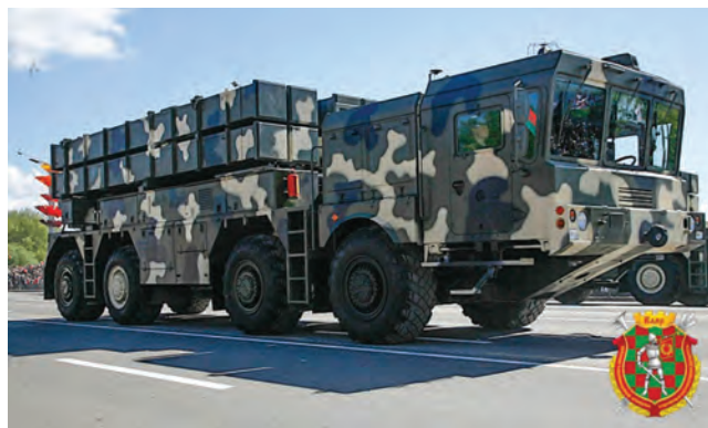
Palanez MLRS.

In addition, Minsk conducts joint military exercises with China. In 2011–2015, three such exercises were held on both Chinese and Belarusian territory.