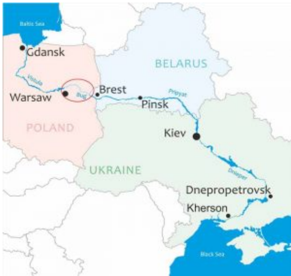
Map of the proposed E40 waterway.

The Polish leg of the project will require the most work, while Belarus has only to partially streamline the Prypiats' River, construct seven locks, and build several other hydro-technical facilities.